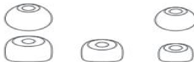
Ear tips * 5 [S / M / L]