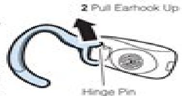
2 Pull Earhook Up