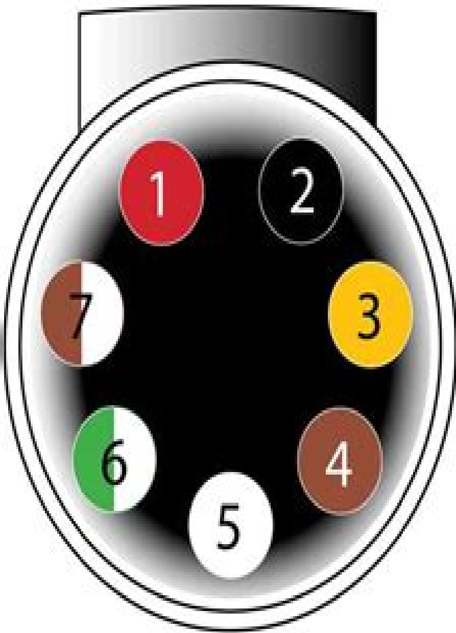
7 Pin Plug