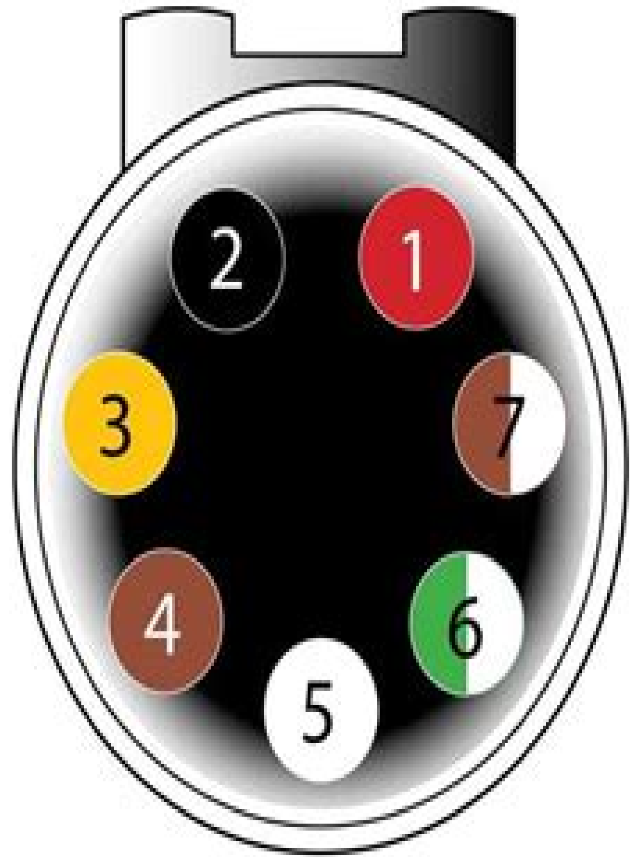
7 Pin Socket