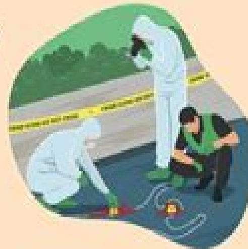
CSI (Crime Scene Investigation)