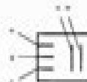
Component Testing Procedures