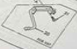
FIG. 101. OPERATOR'S SEAT, COMPLETE, L.S. (FORD) 1960-1969