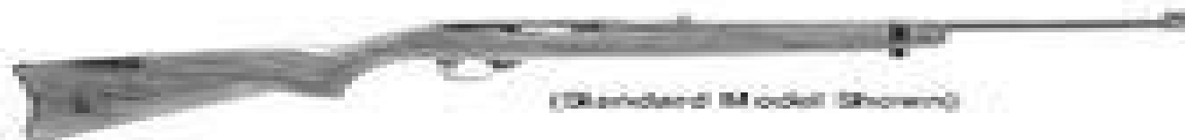
(Standard Model Showing)

STANDARD, DELUXE SPORTER, INTERNATIONAL, TARGET AND ALL-WEATHER MODELS