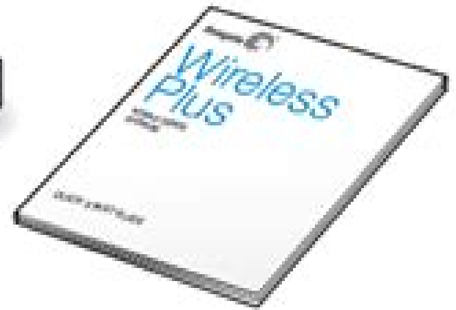
Quick Start Guide