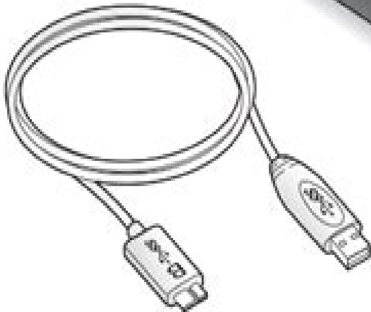
Detachable USB 3.0 Cable