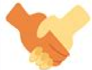
Negotiation and Conflict Resolution