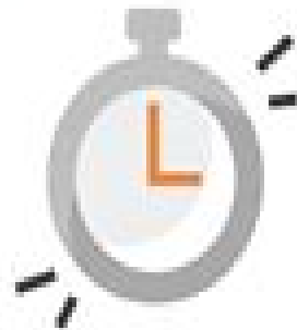
Ability to Work Under Pressure and Time Management