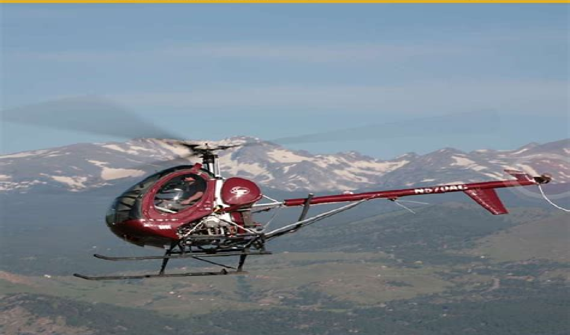
Schweizer 300C™ Helicopter Piston-Powered Multi-Mission