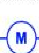
Generic Motor Symbol