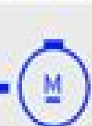
DC Compound Excitation Motor