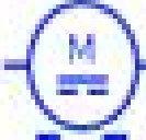
Permanent Magnet DC Motor