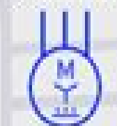
Three-Phase Star Shaped Motor