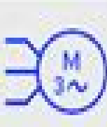
Three-Phase Electric Motor