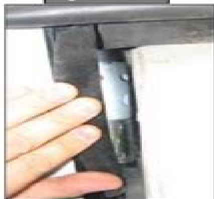
Fig. 5 - Motor