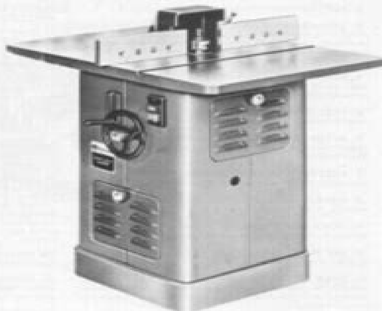
Shown With Accessory 42-240 Table Extension, Cabinet and Drawers