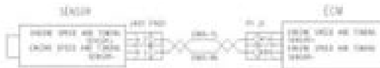
Figure 16 Schematic for the speed/density sensor