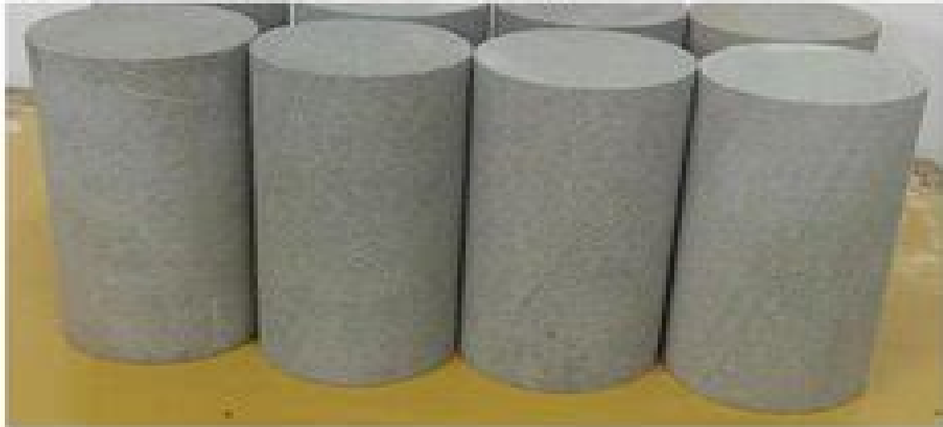
(b) Sandstone rock sample