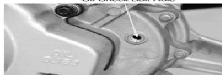
Oil Check Bolt Hole