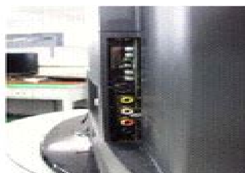
Board with missing plastic cover

Note: Consult the Samsung Service Website at ( www.service.samsungportal.com ) for the Service Manual and other information on this produ