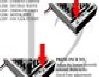
FIGURE 4: Quick Tune Process on RX3 GEN2

The RX3 GEN2 receiver unit is a high performance receiver. It is designed to be used in a variety of environments. The fan installation is a critical part of the receiver's operation. The fan should be installed and the fan should be checked for proper operation.