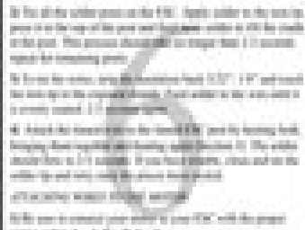
FIGURE 2: Soldering Process on RX3 GEN2

The RX3 GEN2 receiver unit is a high performance receiver. It is designed to be used in a variety of environments. The fan installation is a critical part of the receiver's operation. The fan should be installed and the fan should be checked for proper operation.