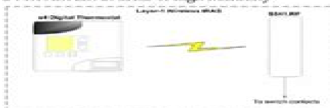
Figure 2 Network Topology