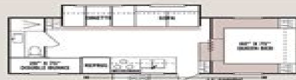
2453P-F - UVW 6090 - Dry Hsch Wt. 1400 - NOC 1910 - Length 26'10"