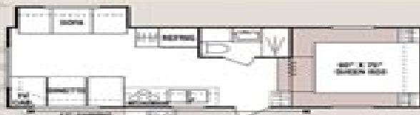
2353P-F - UVW 5460 - Dry Hsch Wt. 1100 - NOC 1540 - Length 25'1"