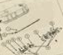
Fig. 1-5: Diagram of the engine

Before disassembling the engine, it is important to label all parts and components. This will help in the reassembly process. The engine should be disassembled in the following order: