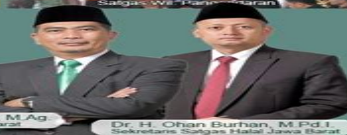
Satgas Wk. Pangandaran