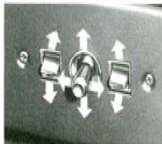
SIX-WAY SEAT CONTROL

The six-way control is located on the side cushion panel of seats so equipped.