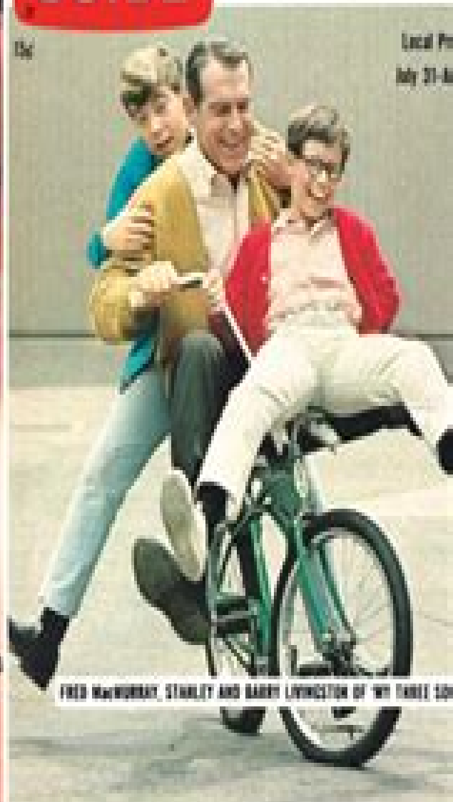
FRED MacMURRAY, STANLEY and BARRY LIVINGSTON OF "MY THREE SONS"