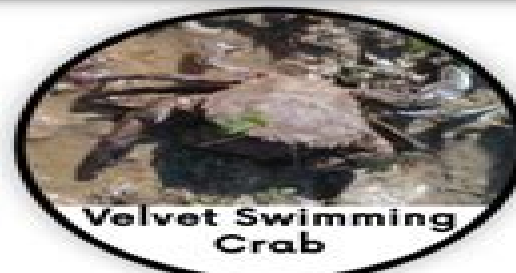
Velvet Swimming Crab