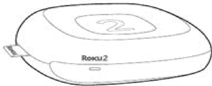
Roku 2 player