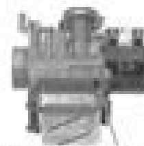
ENGINE BODY IDENTIFICATION NUMBER

The plastic body identification number is stamped on the left side of the middle case.