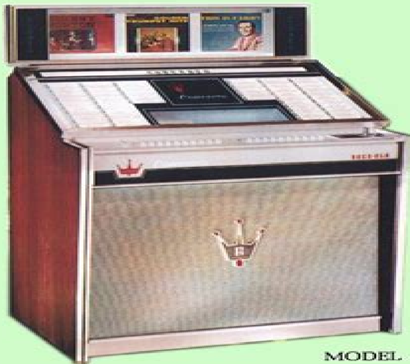
MODEL 434 Concerto 100 SELECTION PHONOGRAPH