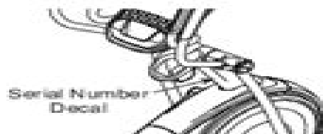
Serial Number Decal

Write the serial number in the space above for reference.