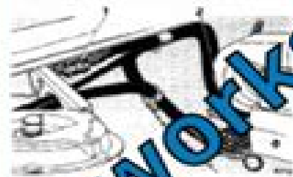
FIG. 20 POSITION OF ENGINE LOOM SOCKET

1. Oil pressure warning lamp switch 2. Filter (fuel) 3. Filter (water) 4. Oil pressure transmitter (if fitted)