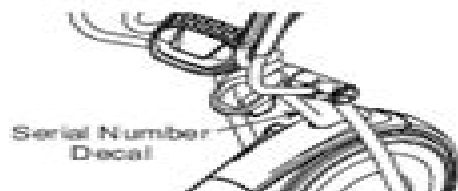
Serial Number Decal

Write the serial number in the space above for reference.