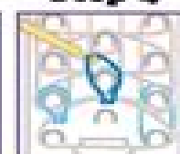
Loop the blue band straight up to the next pin