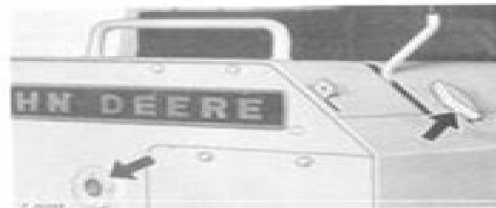
Fig. 8-Hydraulic System Oil Level Window and LATCH

Check oil level in loader hydraulic system. Oil level should be halfway up in oil level window with the bucket rolled back on the ground.