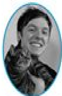
Sam is the author's sister's cat. He enjoys long walks, beam jacks and sitting in the bath.

Rude Vile Pigs is a satirical black comedy set in the city of Sadukitepeopledrinking, and follows the antics of Jim Joy, a middle-aged alcoholic who accidentally creates a religion dedicated to selfishness.