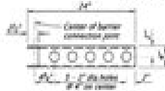
ELEVATION Performed C-shape