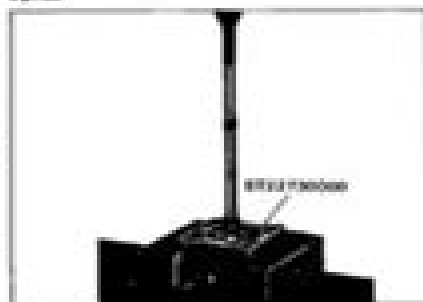
Fig. TB-29 Removing main drive bearing

18. Remove the main bearing from the main shaft by the use of a bearing puller (special tool BT-22100000) and a press.