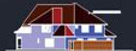
EASTMAN HOUSE SOUTH ELEVATION