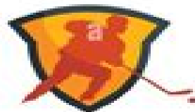
POWER PLAY HOCKEY