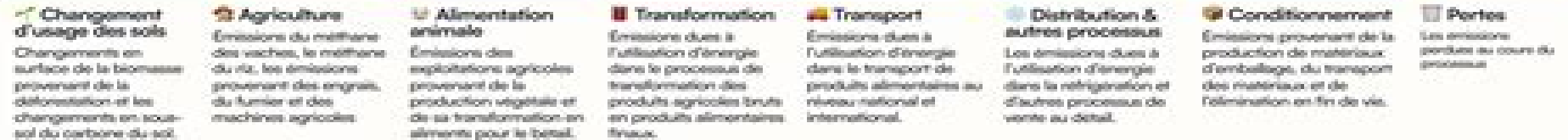
Émissions de GES par kilogramme de produit alimentaire (kg CO2 équivalent par kg produit)