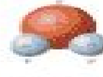
40 Microscopic cell in a tissue sample

Capable of carrying out all the functions of life. Capable of carrying out all the functions of life. 40 — positive charge Capable of carrying out all the functions of life. Capable of carrying out all the functions of life. Capable of carrying out all the functions of life.