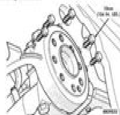
Fig. 17 Rear Seal Assembly