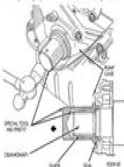
Fig. 14 Front Crankshaft Oil Seal

(1) Install front crankshaft seal and oil pump housing using Special Tool J40400117 (Fig. 14).