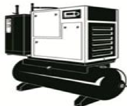
Fully packaged unit with air dryer (horizontal tank)