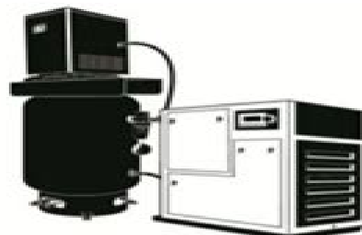
Fully packaged unit with air dryer (vertical tank)