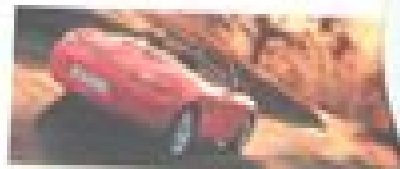
Musik CD Musik CD