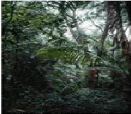
Trees in a rainforest compete for sunlight

All living organisms must _____ with other organisms to _____. This competition prevents the unlimited growth of an organism's _____, which is the number of that kind of plant or animal in an _____. Organisms compete both with other organisms within their own species and with organisms of other species. Competition exists throughout the _____, which is all of the populations within an ecosystem taken together.