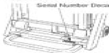
Serial Number Decal

Write the serial number in the space above for future reference.