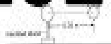
Figure 1 shows a circuit with a battery of EMF 12 V and internal resistance 1 Ω. The circuit is connected as shown in the diagram.