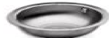
15" CONE TABLE CUT-OUT = 15"