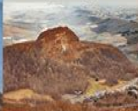
Showa Shinjan, Japan