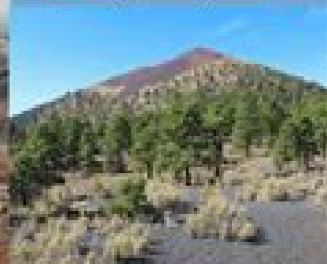
Sunset Crater, Arizona