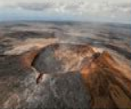
Mauna Loa, Hawaii