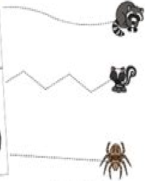
Animals: Raccoon, Cat, Spider