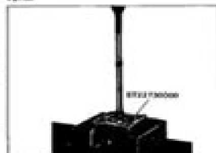
Fig. TB-29 Removing main drive bearing

18. Remove the main bearing from the main shaft by the use of a bearing puller (special tool BT-27100000) and a pin.